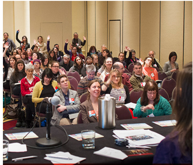
2014 National Women's Bicycling Forum break-out session (Brian Palmer)