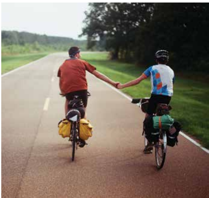
Second place in the Bicycle Friendly America photo contest.