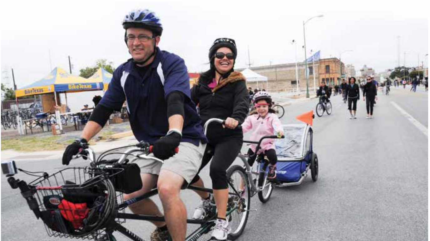
San Antonio.

of BikeTexas, agrees: “States across the south face a similar political climate that is not overly accepting of active transportation, and may be outright hostile towards biking and walking.”