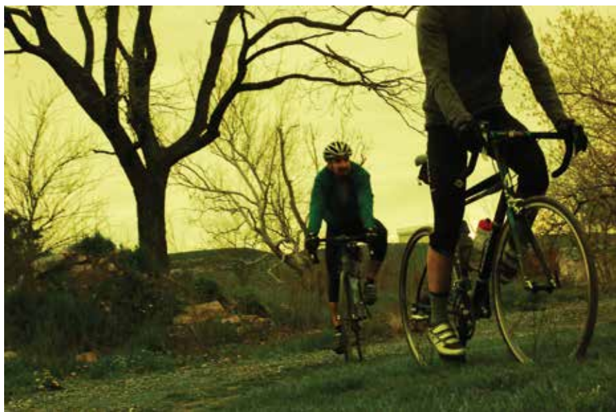
Riding in the Shenandoah Valley.

THE SVBC HOLDS THE HARRIS-ROUBAIX EVERY YEAR – WHAT'S THE HISTORY OF THAT RACE? We're fortunate to have a plethora of unpaved dirt surface roads in the area but each year more and more are lost to pavement. The Harris-Roubaix is more than a race — it's a celebration of dirt roads and an opportunity to welcome spring in an idyllic setting. The event is more than a decade old and is always held the same day as that other Roubaix-named event in France. The dirt roads make the event especially magical and accessible. While the event is a race for some, a much shorter ride for others on these dirt roads ensures that everyone can experience the fun.