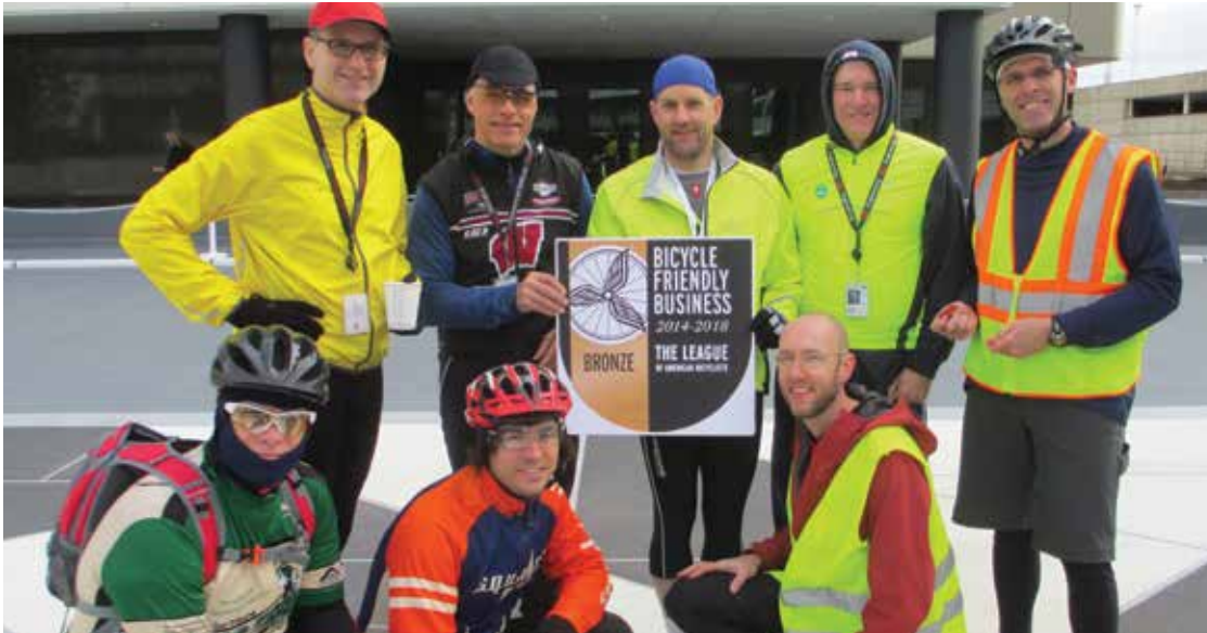
3M celebrates its bronze award

lowing them to take a leisurely ride during lunch shared bicycles are a fantastic perk and a good way to encourage new ridership. Facebook (Platinum BFB) has three different bike fleets totaling almost 200 bicycles for long- and short-term use by employees. USAA (Silver BFB) offers bicycles and tricycles to help their employees move from one end of their main building to the other. For corporations located in urban areas, free access to existing public bike share systems is more common. Target headquarters (Platinum BFB), located in downtown Minneapolis, not only sponsored a dedicated NiceRide station on their property but also offers 100 free annual subscriptions and 1,000 free day passes to their 10,000 on-site employees.