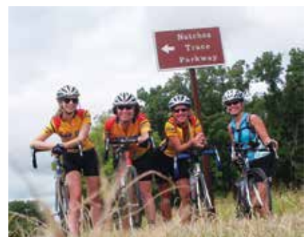
Mississippi.