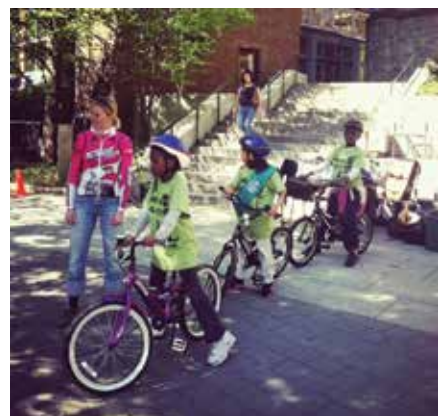
Girl Scouts on wheels.